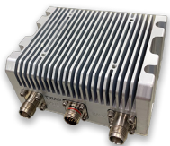
Dual Bi-Directional SSPA TTRM2005DR