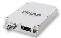
Wideband Amplifier TA1217