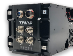
High Power Radio THPR1070