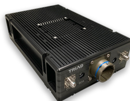
High Power Radio THPR1012

TRIAD High Power Radio Systems are a wireless network architect's best choice when time, cost, and optimal performance and range are critical. These fully-integrated and optimized radios are an evolution of many years of experience enabling some of the highest data-rate, longest range ISR wireless links in the Unmanned Land, Sea, and Air Systems industry.