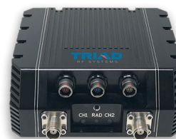
High Power Radio THPR1021