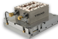
Dual Bi-Directional SSPA TTRM2021