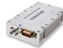
Wideband Amplifier TA1216

Triad's line of Wideband Amplifier modules for extended range amplified radio applications set the bar for efficiency, linearity, and size-to-power ratio. We have designed hundreds of COTS modules for exacting frequencies up to 40 GHz. They offer high power levels into the hundreds of watts for your EW and CUAS needs. If a standard RF/microwave amplifier design does not fit your exact requirements, we're specialists in creating custom-modified versions of any of our COTS power amplifier modules.