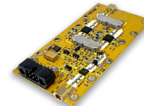
Power Amplifier TA1134