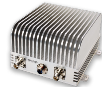
Dual Bi-Directional SSPA TTRM1132DR