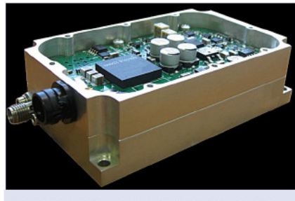
Figure 2: The DC supply board allows a wide input voltage range.

The module is constructed with the RF transmit section on the top side of a multi-layer board and the receive section on the bottom side to provide isolation between the two. The wide-input-range DC supply is housed in its own section that sits on top of the RF portion. This modular approach allows a number of solid-state power amplifier models to share a common DC supply board. The transmitter employs a GaAs MMIC-based amplifier line-up, and the receive section achieves a noise figure of 4 dB. The result is a module with performance equally suited for commercial and military applications that can be specified for indoor or outdoor use and operates over a temperature range of -20° C to +85° C and an altitude up to 30,000 ft.